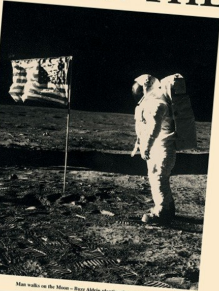
Man walks on the Moon - Buzz Aldrin planting the American flag.

Armstrong and Aldrin are expected to remain in the module after less than a day on the Moon's surface. If all goes according to plan, they will rendezvous with Collins on Apollo 11, splash down in the Pacific Ocean and return to a hero's welcome on earth.